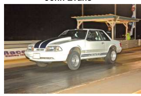
Street Shoot-out winner: Ryan Simmons